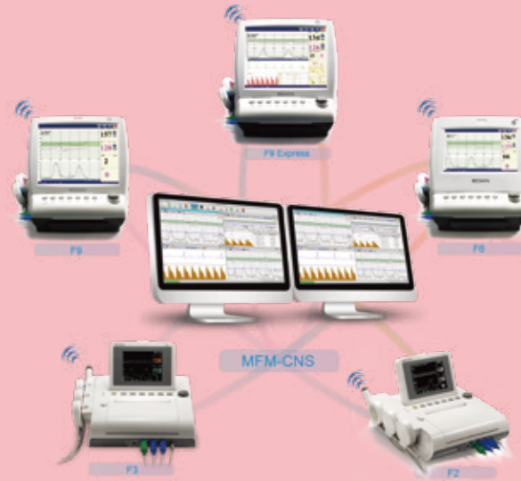
MFM-CNS Central Monitoring System