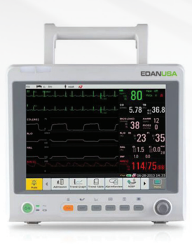
iM70 Patient Monitor