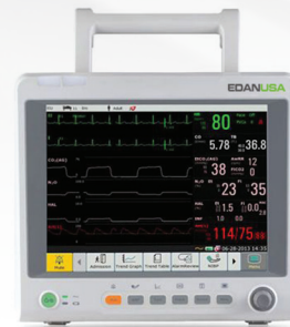
iM70 Patient Monitor