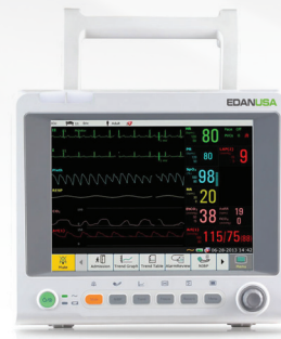
iM60 Patient Monitor